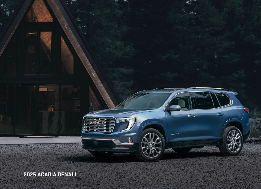
2025 ACADIA DENALI