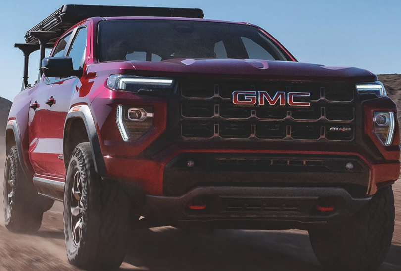
2025 GMC CANYON AT4