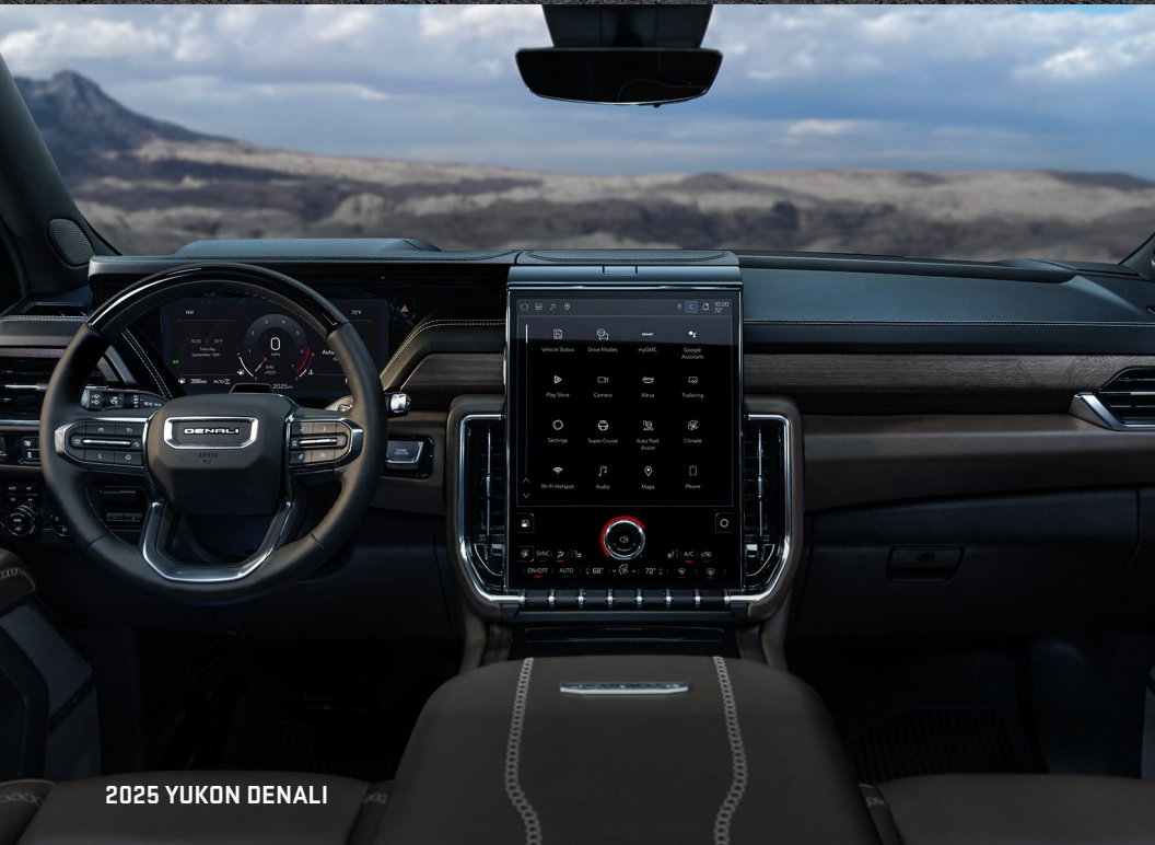
2025 YUKON DENALI