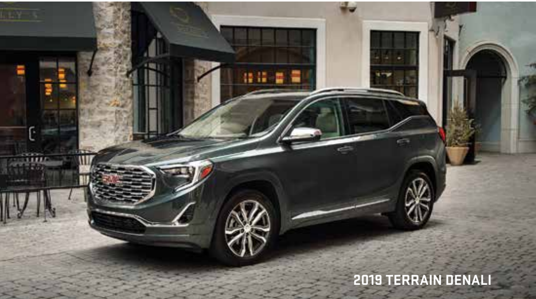
2019 TERRAIN DENALI

If you haven't completed your complimentary pre-return inspection and you think you might have excess wear and use on your vehicle, now is the time to schedule it, so you can be prepared.