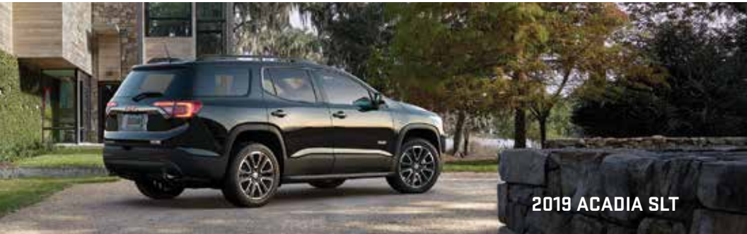
2019 ACADIA SLT

Schedule a pre-return inspection within 120 days of lease end for a report on wear and use and how that can affect lease-end fees. See pages 6-9 for more details on wear and use.