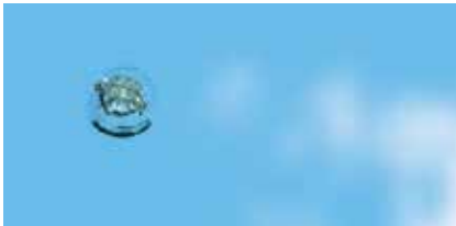
Cracked glass less than 1/2” in diameter