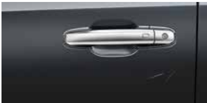
1 dent or 2 scratches (less than 4”) per panel