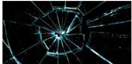
Cracked glass greater than 1/2” in diameter or spidered cracks