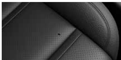
Upholstery holes smaller than 1/8"