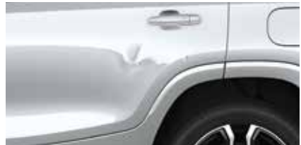
Hail damage or punctures on any panel