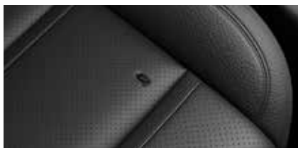
Upholstery holes larger than 1/8"