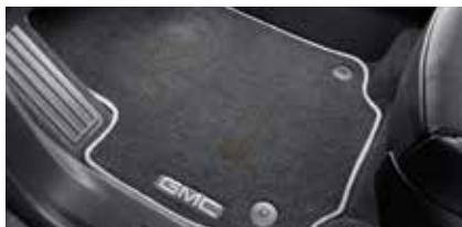
Removable stains and minor carpet wear